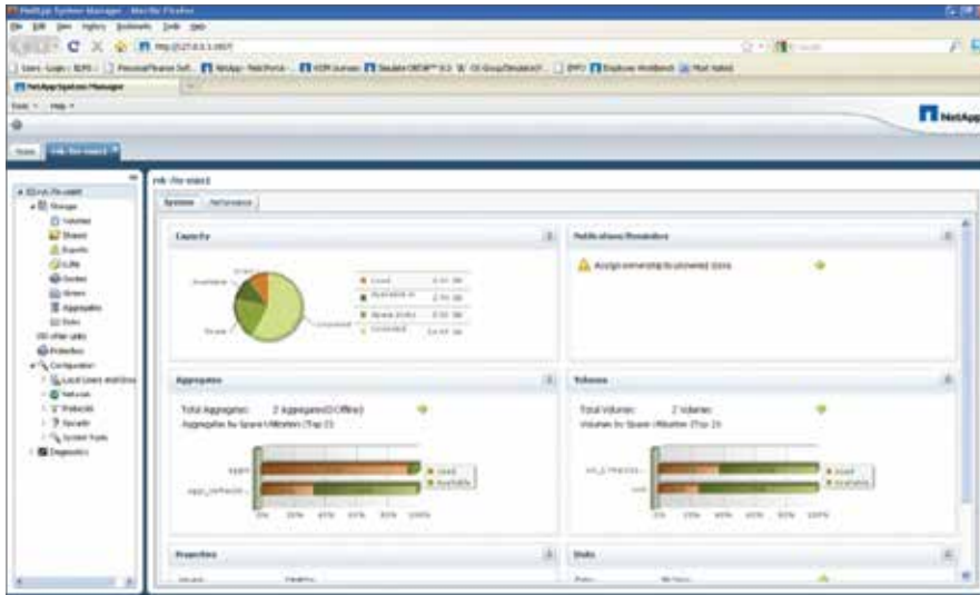
Figure 2) You don't need to be an expert to configure your storage with the simple, easy-to-use NetApp System Manager console.

With best-in-class data management and control for the hybrid cloud, NetApp cloud solutions enable seamless movement of data in and out of the cloud.